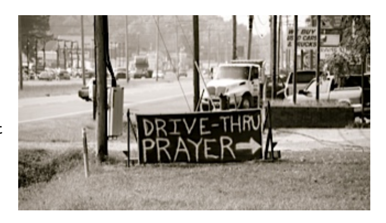
Monochrome Print by Dolores Burns